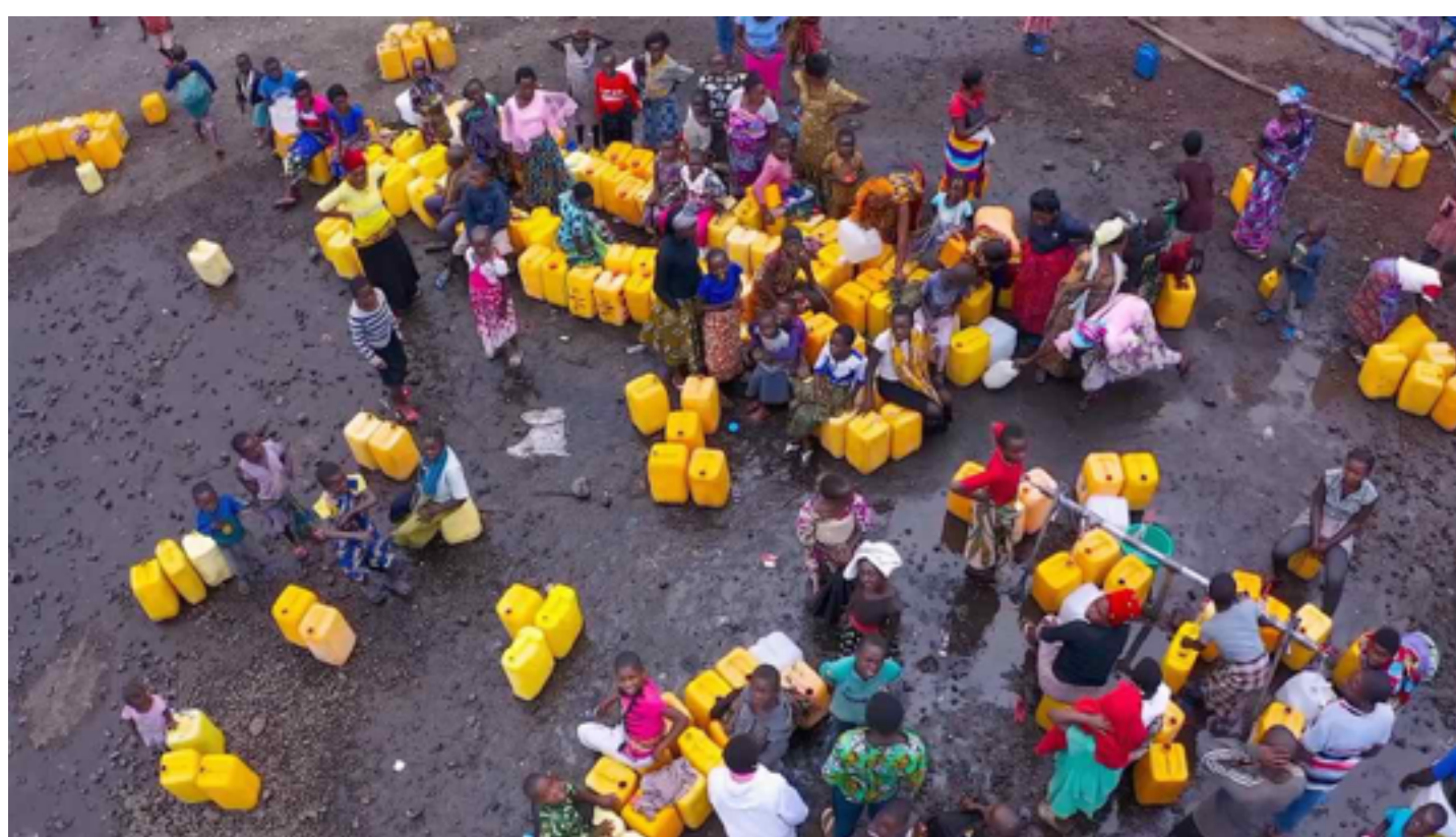
Displaced Christians waiting to get clean water in the Democratic Republic of Congo

Upon publication, a digital version of our Africa Update will be available for download from 24th October here .