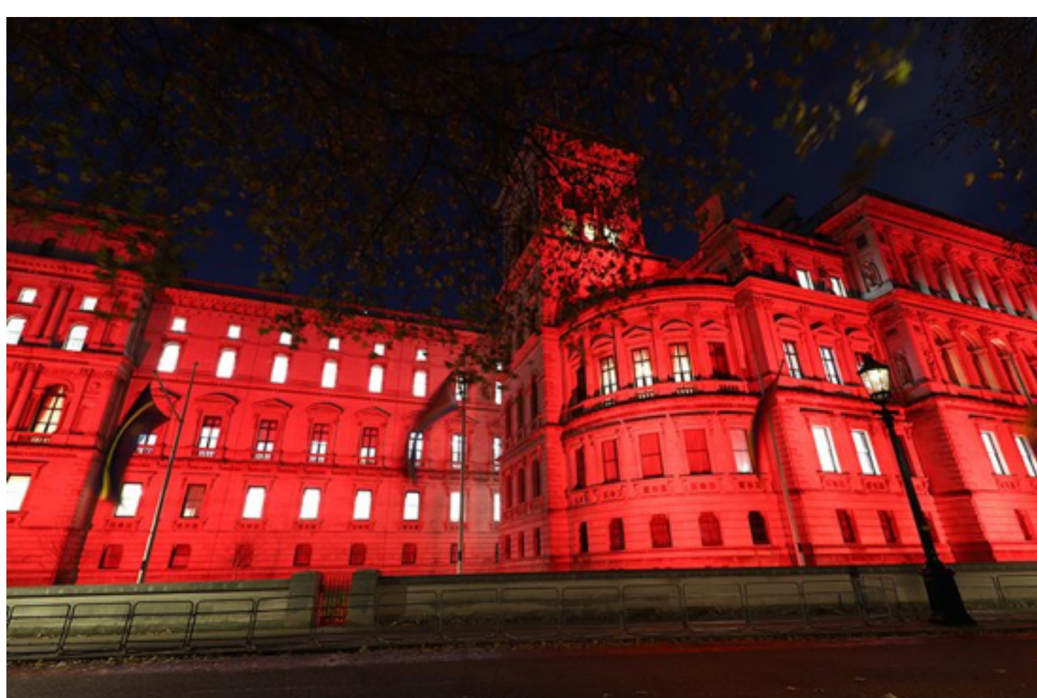
Image: Foreign, Commonwealth and Development Office (FCDO) lit up red for #RedWednesday in 2022

PLEASE SUPPORT SUFFERING CHRISTIANS IN AFRICA THIS #RedWednesday