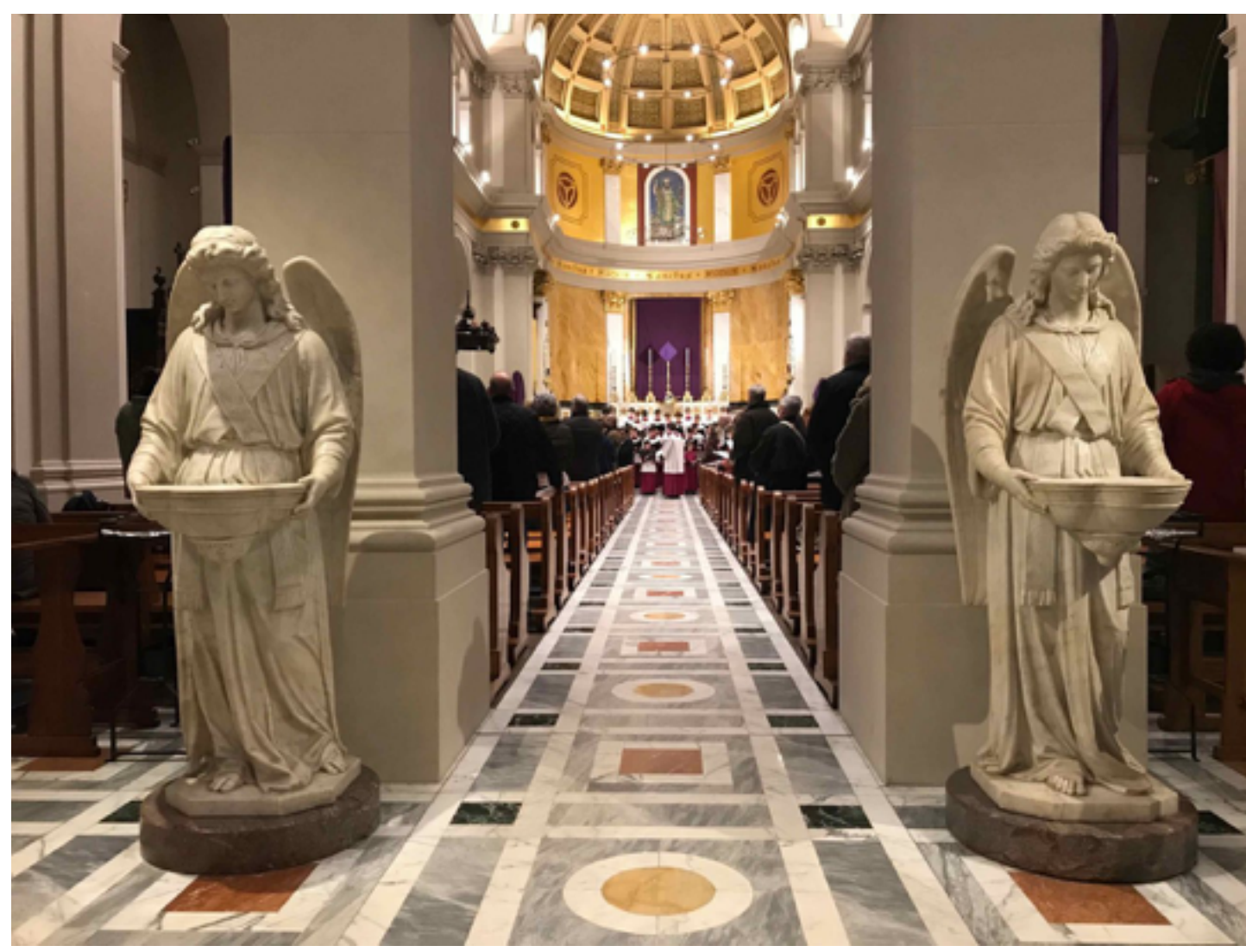
St Patrick's Church, Soho