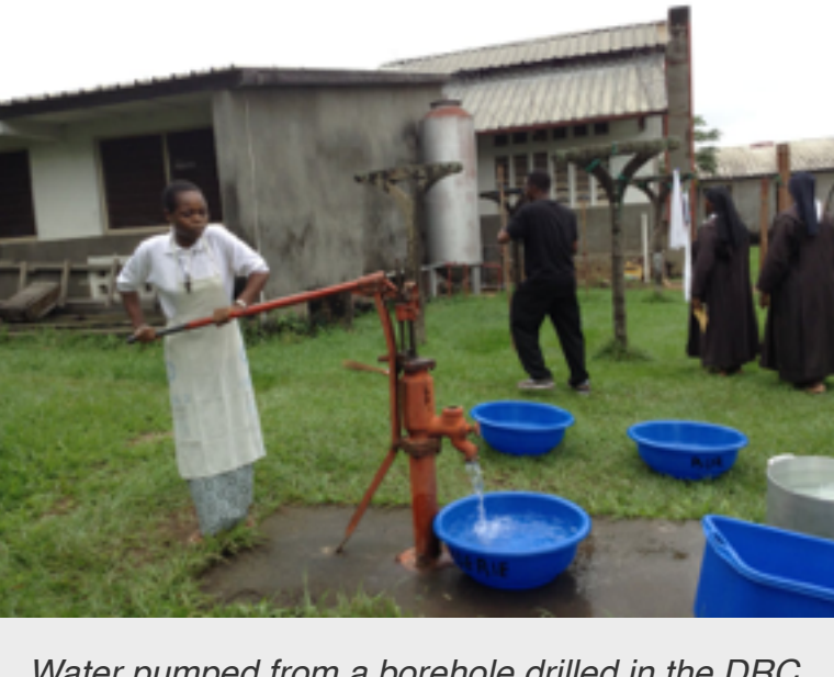
Water pumped from a borehole drilled in the DRC.