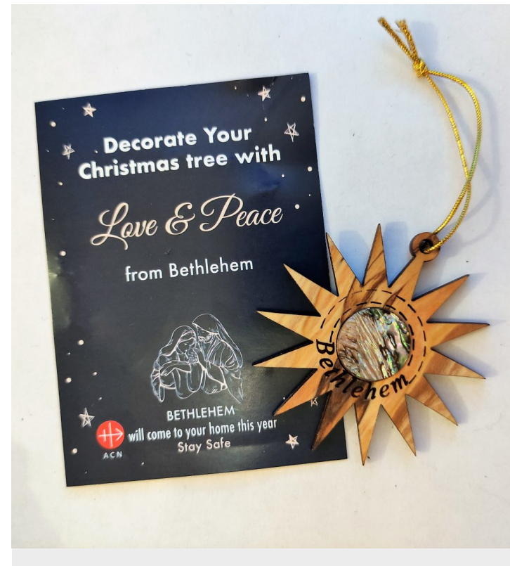
Bethlehem Star with Mother of Pearl Tree Ornament

To reserve your individual/group places please click here . Representatives of African communities especially welcome. If you are at a distance there will be a livestream of the Mass available.